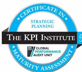
Micro-certificate in Strategy Planning Maturity Assessment