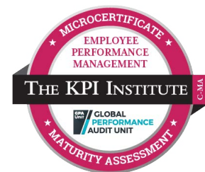
Micro-certificate in Employee Performance Maturity Assessment

NOTE: These three micro-certificates are not offered as part of the Certified Agile Strategy Execution Professional Program, they can be purchased separately.