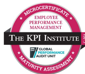
Micro-certificate in Employee Performance Maturity Assessment

NOTE: These three micro-certificates are not offered as part of the Certified Agile Strategy Execution Professional Program, they can be purchased separately.