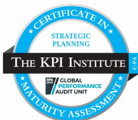
Micro-certificate in Strategy Planning Maturity Assessment