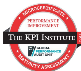
Micro-certificate in Performance Improvement Maturity Assessment