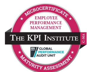
Micro-certificate in Employee Performance Maturity Assessment

NOTE: These three micro-certificates are not offered as part of the Certified Balanced Scorecard Management System Professional Program, they can be purchased separately.