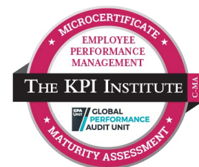
Micro-certificate in Employee Performance Maturity Assessment

NOTE: These three micro-certificates are not offered as part of the Certified Data Analysis Professional Program, they can be purchased separately. For more information, CLICK HERE