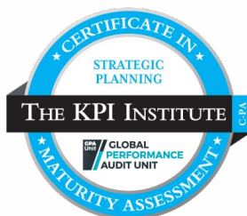
Micro-certificate in Strategy Planning Maturity Assessment