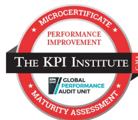
Micro-certificate in Performance Improvement Maturity Assessment