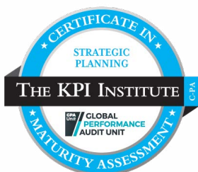
Micro-certificate in Strategy Planning Maturity Assessment