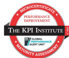
Micro-certificate in Performance Improvement Maturity Assessment

NOTE: These three micro-certificates are not offered as part of the Certified Employee Performance Management Professional Program, they can be purchased separately.