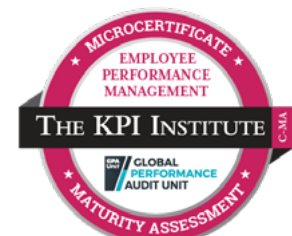
Micro-certificate in Employee Performance Maturity Assessment

NOTE: These three micro-certificates are not offered as part of the Certified OKR Professional Program, they can be purchased separately. For more information, CLICK HERE