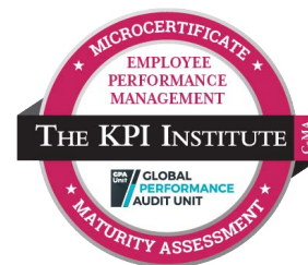
Micro-certificate in Employee Performance Maturity Assessment

NOTE: These three micro-certificates are not offered as part of the Certified Agile Strategy Execution Professional Program, they can be purchased separately.