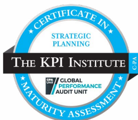
Micro-certificate in Strategy Planning Maturity Assessment