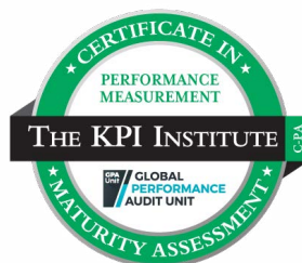
Micro-certificate in Performance Measurement Maturity Assessment