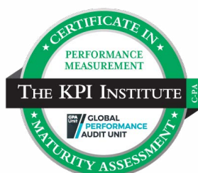
Micro-certificate in Performance Measurement Maturity Assessment