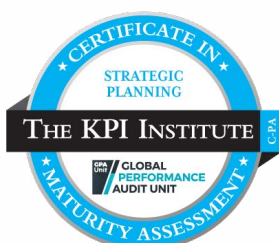
Micro-certificate in Strategy Planning Maturity Assessment