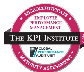
Micro-certificate in Employee Performance Maturity Assessment

NOTE: These three micro-certificates are not offered as part of the Certified Agile Strategy Execution Professional Program, they can be purchased separately.