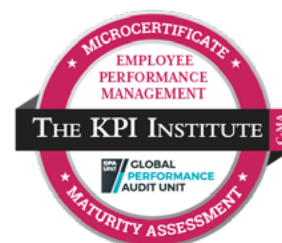
Micro-certificate in Employee Performance Maturity Assessment

NOTE: These three micro-certificates are not offered as part of the Certified Agile Strategy Execution Professional Program, they can be purchased separately.