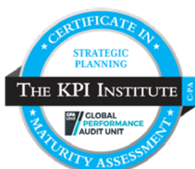
Micro-certificate in Strategy Planning Maturity Assessment