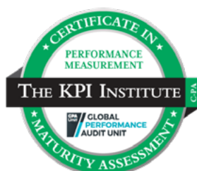
Micro-certificate in Performance Measurement Maturity Assessment