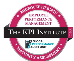
Micro-certificate in Employee Performance Maturity Assessment

NOTE: These three micro-certificates are not offered as part of the Certified Balanced Scorecard Management System Professional Program, they can be purchased separately.