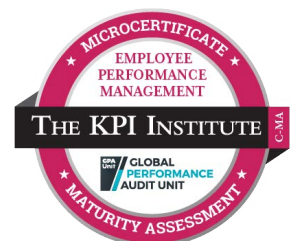
Micro-certificate in Employee Performance Maturity Assessment

NOTE: These three micro-certificates are not offered as part of the Certified Balanced Scorecard Management System Professional Program, they can be purchased separately.