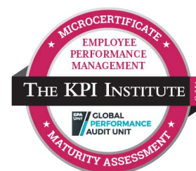
Micro-certificate in Employee Performance Maturity Assessment

NOTE: These three micro-certificates are not offered as part of the Certified Balanced Scorecard Management System Professional Program, they can be purchased separately.