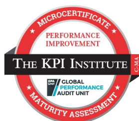
Micro-certificate in Performance Improvement Maturity Assessment