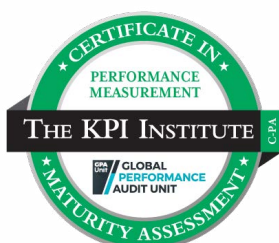
Micro-certificate in Performance Measurement Maturity Assessment