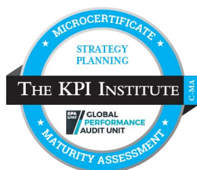
Micro-certificate in Strategy Planning Maturity Assessment