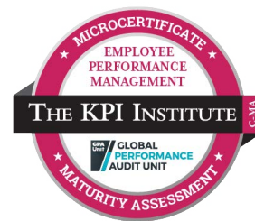
Micro-certificate in Employee Performance Maturity Assessment

NOTE: These three micro-certificates are not offered as part of the Certified Data Visualization Professional Program, they can be purchased separately. For more information, CLICK HERE