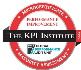
Micro-certificate in Performance Improvement Maturity Assessment