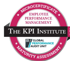
Micro-certificate in Employee Performance Maturity Assessment

NOTE: These three micro-certificates are not offered as part of the Certified Innovation Professional Program, they can be purchased separately. For more information, CLICK HERE