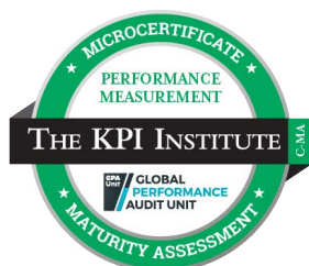
Micro-certificate in Performance Measurement Maturity Assessment