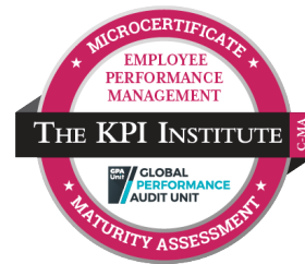
Micro-certificate in Employee Performance Management Maturity Assessment

NOTE: These three micro-certificates are not offered as part of the Certified KPI Professional Program, they can be purchased separately. For more information, CLICK HERE