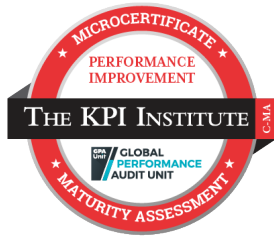
Micro-certificate in Performance Improvement Maturity Assessment