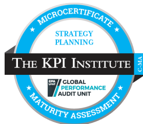
Micro-certificate in Strategy Planning Maturity Assessment