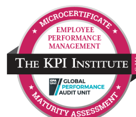
Micro-certificate in Employee Performance Maturity Assessment

NOTE: These three micro-certificates are not offered as part of the Certified KPI Professional Program, they can be purchased separately. For more information, CLICK HERE