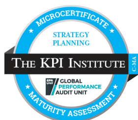
Micro-certificate in Strategy Planning Maturity Assessment