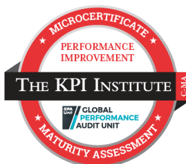
Micro-certificate in Performance Improvement Maturity Assessment