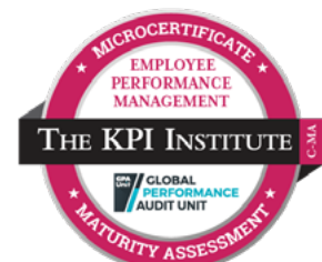
Micro-certificate in Employee Performance Maturity Assessment

NOTE: These three micro-certificates are not offered as part of the Certified OKR Professional Program, they can be purchased separately. For more information, CLICK HERE