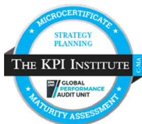
Micro-certificate in Strategy Planning Maturity Assessment