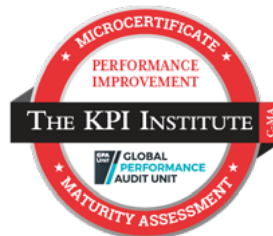
Micro-certificate in Performance Improvement Maturity Assessment