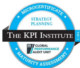
Micro-certificate in Strategy Planning Maturity Assessment