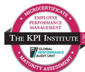
Micro-certificate in Employee Performance Maturity Assessment

NOTE: These three micro-certificates are not offered as part of the Certified Performance Management Professional Program, they can be purchased separately.