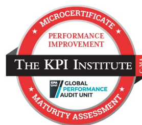
Micro-certificate in Performance Improvement Maturity Assessment