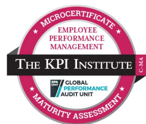
Micro-certificate in Employee Performance Maturity Assessment

NOTE: These three micro-certificates are not offered as part of the Certified Strategy & Business Planning Professional Program, they can be purchased separately.