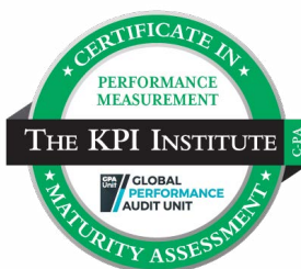
Micro-certificate in Performance Measurement Maturity Assessment