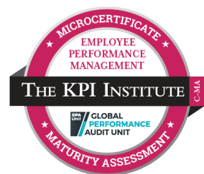
Micro-certificate in Employee Performance Maturity Assessment

NOTE: These three micro-certificates are not offered as part of the Certified Strategy & Business Planning Professional Program, they can be purchased separately.